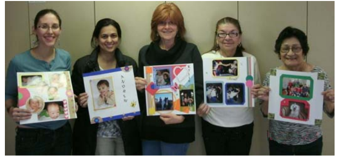
Scrapbook class members show off their work