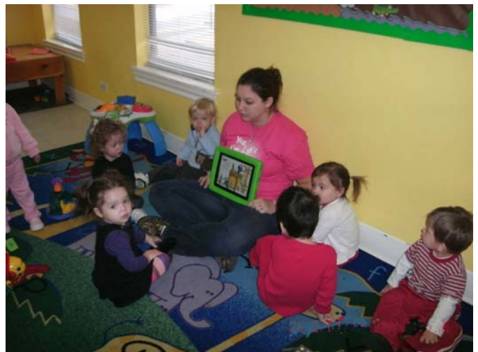
Toddler time with iPads