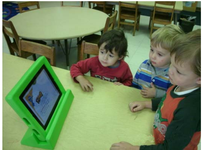
Mother's Day Out Time with iPads