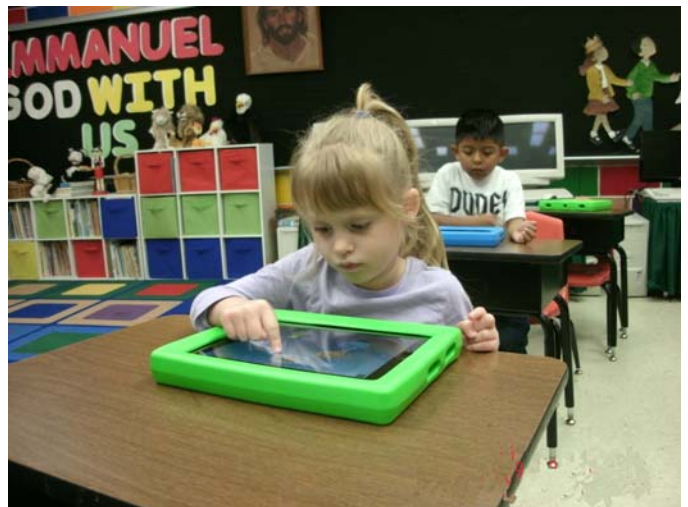
Pre-K time with iPads